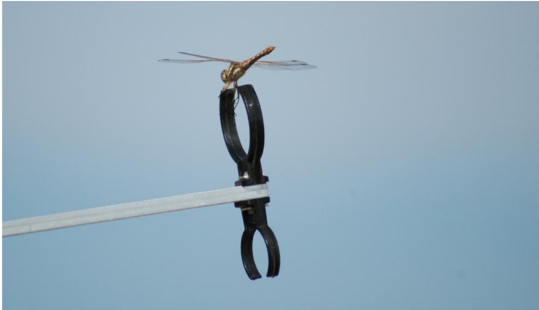
“Dragonfly on Stooge”...perhaps one of the best free flight pictures ever! By Cathy Snider

Which leads to a thought of many captions for this photo, especially when you consider the Dragonfly on the cover of the latest Digest