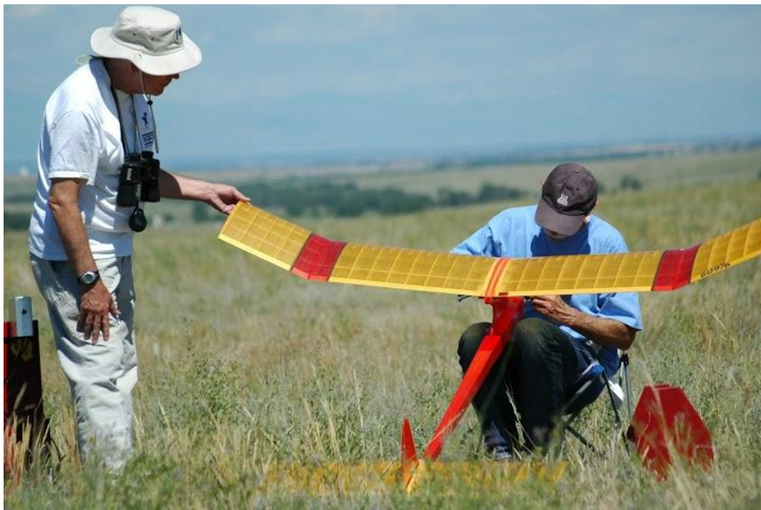
“Excuse me Dr. Wineland, I have this question about the Higgs/Boson Particle..”

Which leads to a thought of many captions for this photo, especially when you consider the Dragonfly on the cover of the latest Digest