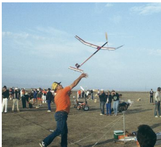
The Launch For the Team !