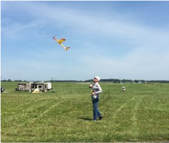
Mike Vancil, from TN, launches a show room quality classic "Speckled Bird" rubber powered ship. Eat your heart out at that huge grass field

Exciting? One must keep their eyes to the sky. I was retrieving a test flight when a thundering class "C" free flight came screaming down under a full head of steam and buried itself no more than 30 feet away. The soft soil absorbed much of the impact as the plane buried itself up to the pylon.