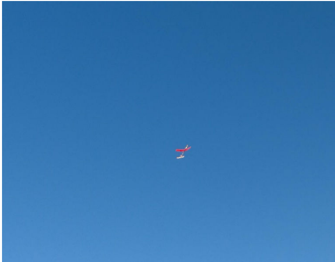
The Soaring Falcon lives up to its name! Skilly DeLoach's P-30 on the climb-out for a max. How blue was our sky? See for yourself.