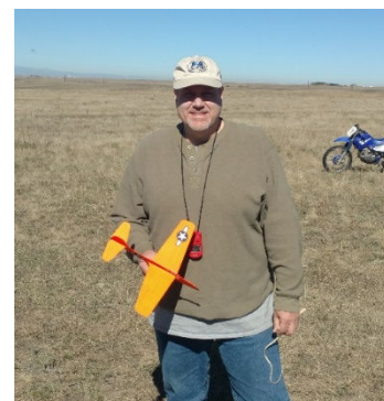
Tom Norell's P-59 Airacomet for Jet Cat is a beauty. The finish, including panel lines, is exquisite. Still undergoing fine trimming, it's obviously potent.