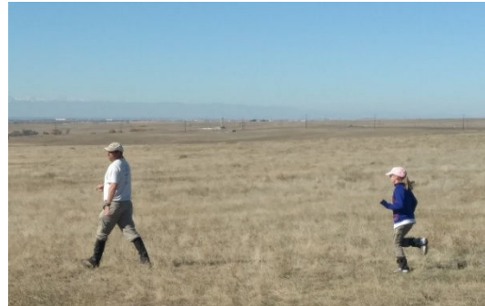
And off they go! Skilly rushes to catch up with Dad as they begin the chase. She won the Scramble, with three nice maxes.