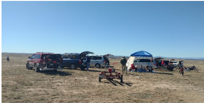
Looking down the parking line, mid-morning. Turnout was fine!