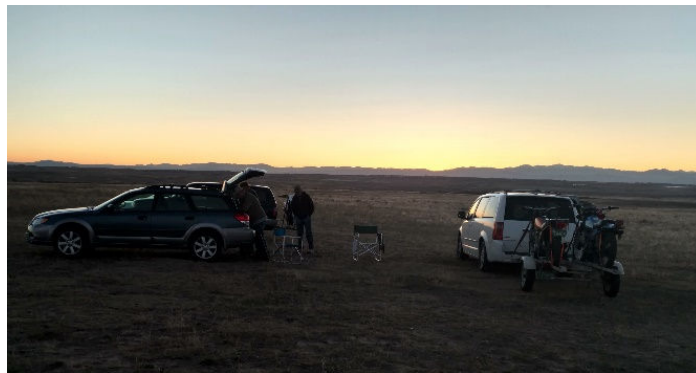
The perfect end to a perfect day of autumn flying. Some of us just had to linger as the sun went down. It was that kind of day.