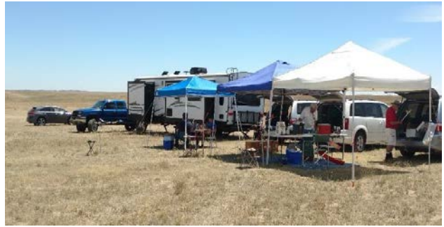
Partial view of flight line on Saturday.

P.S. As this is being written (eleven days after the contest), we're not aware of any participants or family members showing any signs of COVID. We hope it stays that way!