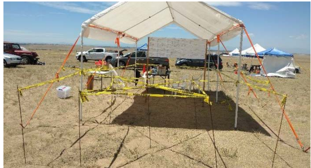
View of Contest HQ.

Note the social distancing enforced by the placement of the scoreboard and the two "viewing lanes" in the foreground, on the right and left of the area X'd off with yellow caution tape.