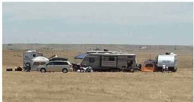
Menanno family encampment.

Note the social distancing enforced by the placement of the scoreboard and the two "viewing lanes" in the foreground, on the right and left of the area X'd off with yellow caution tape.