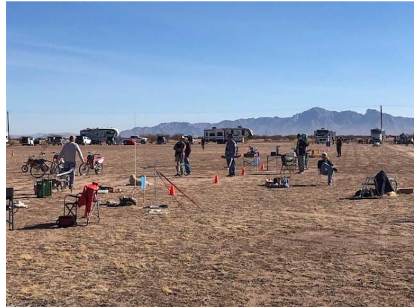
A Field where dreams are made