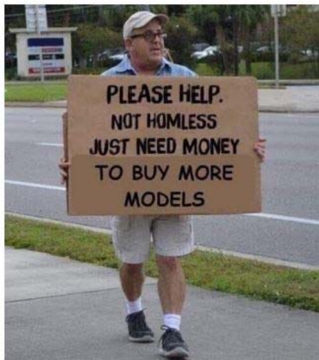
SAM Speaks - January~February 2019 - Page