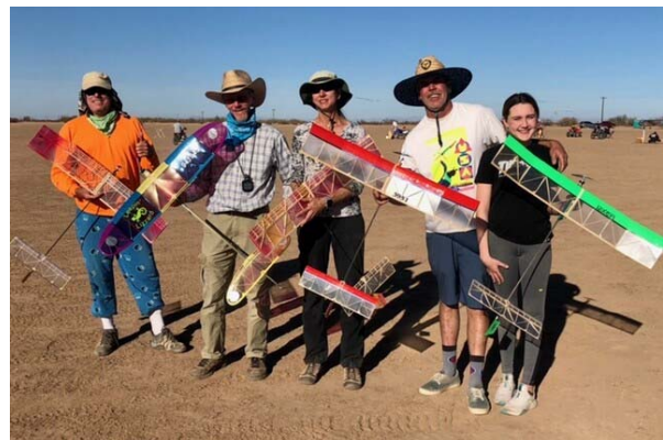
Either 36 or S